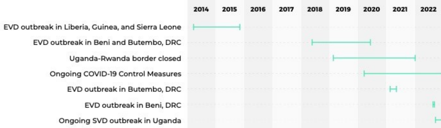
Figure 1. Timeline of previous outbreaks and border closures and control measures

Due to a high-level political dispute, the Uganda-Rwanda border was closed on 27 February 2019. With the exception of transiting freight vehicles, the Rwandan government prohibited Ugandan and Rwandan nationals from crossing the border other than in exceptional circumstances. This created a temporary livelihood crisis in border districts where residents relied on cross-border trade. 11 The closure was enforced, at times forcefully, by Rwandan security forces. This situation extended through the COVID-19 crisis, and the border only formally reopened in January 2022. 12