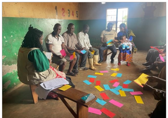
Malawi Red Cross Society (MRCS) staff conducting RQA data collection activities as part of focus group discussions with religious leaders in Area 25, Lilongwe.

RQAs are an essential tool for understanding community perceptions and behaviours related to cholera. Rapid Qualitative Assessments or Rapid Qualitative Research draws on primary data collected through observational activities, in-depth interviews and focus groups discussions, are typically conducted over the course of a few days by a small team, and seek to answer operational research questions useful for informing emergency response operations. 4 These assessments provide valuable information about the social, cultural, and behavioral factors that influence the transmission of cholera within a community. By identifying the beliefs, attitudes, and practices that contribute to the spread of cholera, RQAs can inform the development of targeted interventions that address the specific needs and challenges of the community.